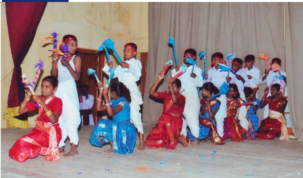
Wanni Region Adappankulam evening class children

Children also came from Pilana, Galle down South and many from the East , from Omadoyamadhu, Thiraimadhu, Periya Nilavanai, Kalmunai, Kaluwanchikudi, and Onthatchimadam