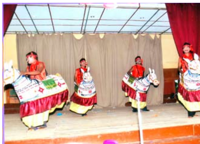
horse dance by Jaffna College students