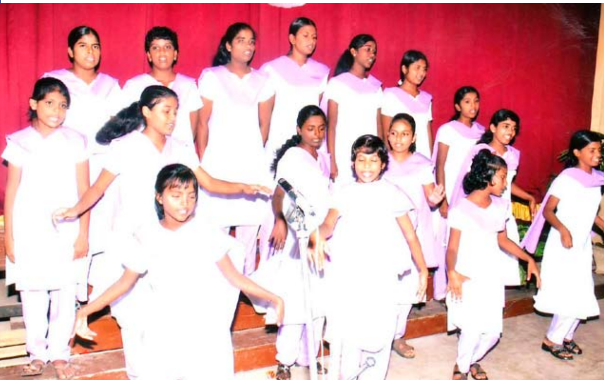
Uduvil Girls' College children

More than 2000 children participated in the Annual Children's Rally held at Vaddukoddai Friday November 5. A remarkable landmark this year was the participation especially of children from the Wanni from such parishes as Visuvamadhu, Suthanthirapuram, Kilinochchi, Murippu, Konavil, Bharatipuram, Murugandy, Mankulam, Veerapuram, Adampankulam and Cheddikulam.