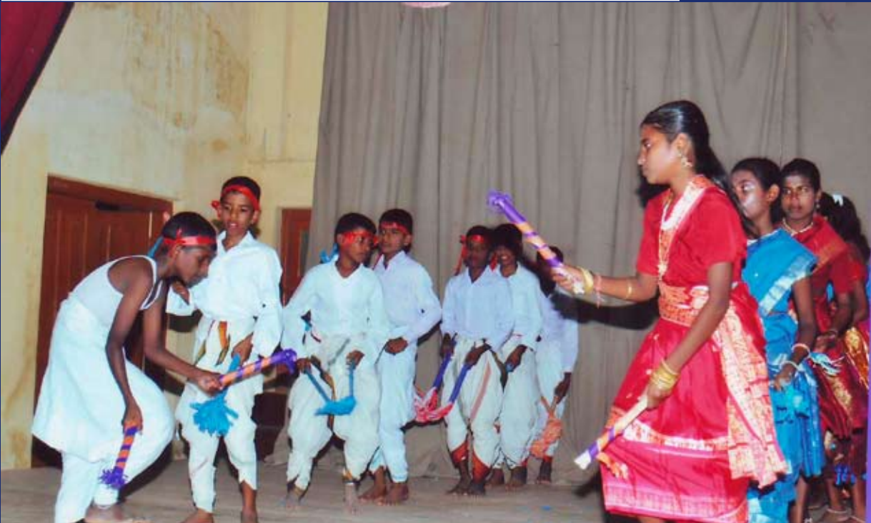
Wanni Region Adappankulam (near Cheddikulam) children 'kolladdam'

More than 2000 children participated in the Annual Children's Rally held at Vaddukoddai Friday November 5. A remarkable landmark this year was the participation especially of children from the Wanni from such parishes as Visuvamadhu, Suthanthirapuram, Kilinochchi, Murippu, Konavil, Bharatipuram, Murugandy, Mankulam, Veerapuram, Adampankulam and Cheddikulam.