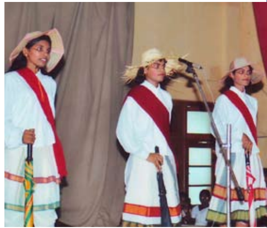
Drama: children of JDCSI 'Harriet Winslow memorial' Hostel children

In the Bible Quiz, Uduvil became the winners in both competitions (Under 16 and Under 13) while Chankanai were runners-up in the Senior team and Pandateruppu in the Junior team